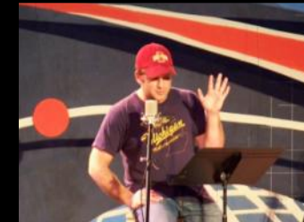
You Have No Idea