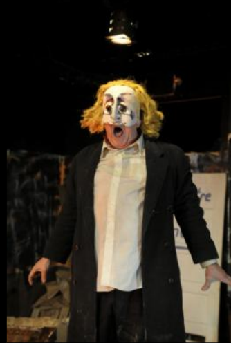
The Madness of Oscar Wilde