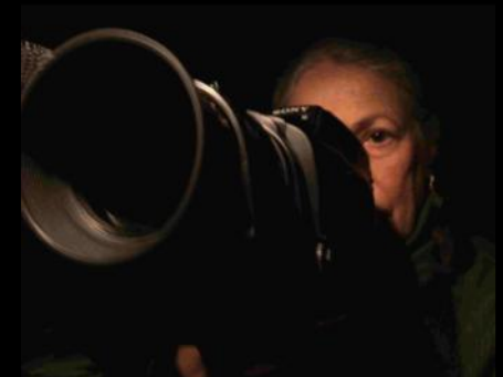
Los Vientos des Marzo