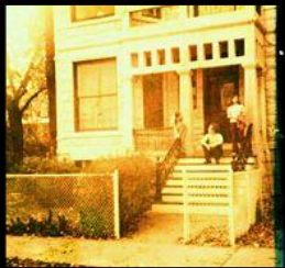
The Front Steps